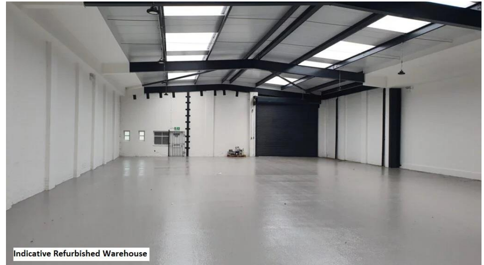
Indicative Refurbished Warehouse