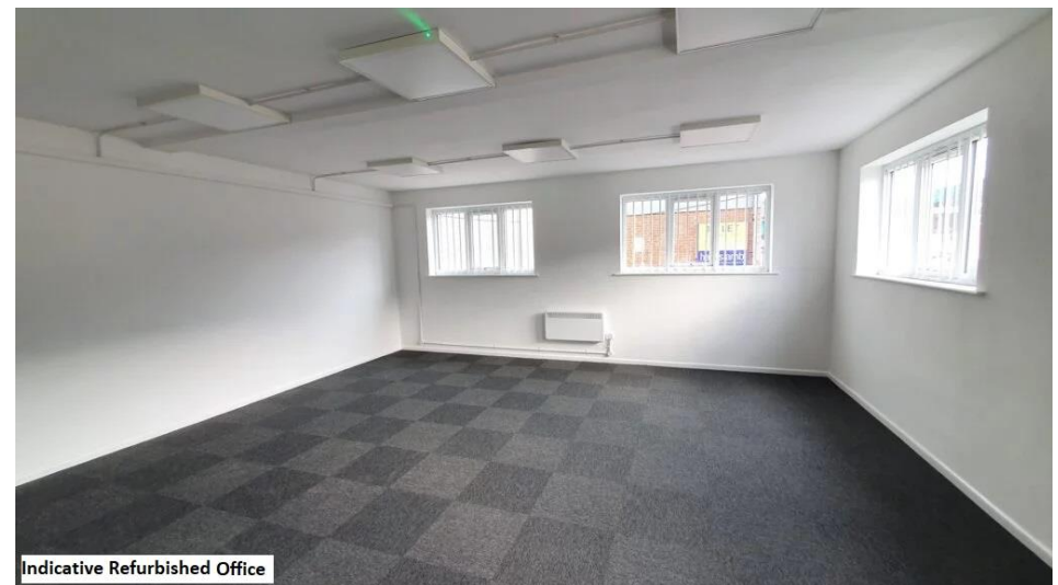
Indicative Refurbished Office

Mounsey Surveyors Limited Conditions under which Particulars are issued Messrs. Mounsey Chartered Surveyors for any joint agents and for the vendors or lessors of this property whose agents they are, give notice that: